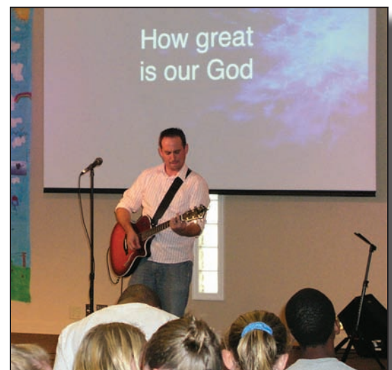
Praise and worship time