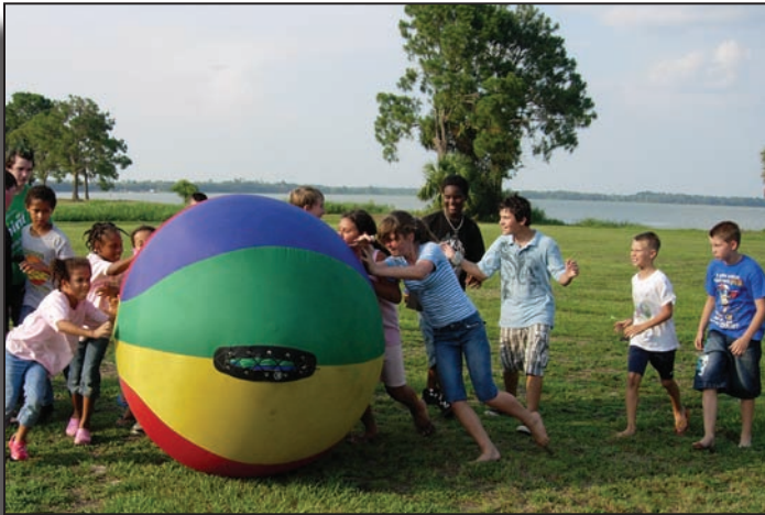
Playing monster ball