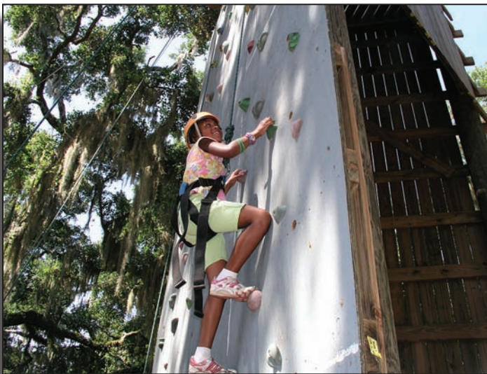
Conquering the climbing wall