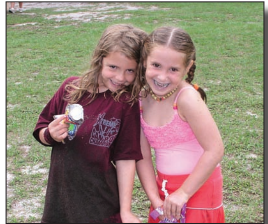
Being best friends