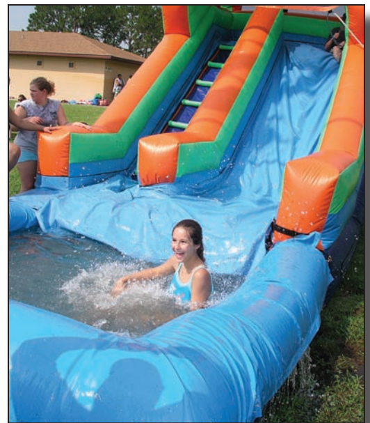
Getting wet and wild on the water slide

Special thanks to the following individuals for making this year’s camp a great success!