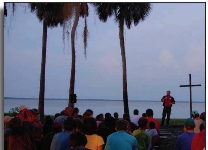
Having chapel service by Lake Yale

Residents and staff of the Florida Baptist Children's Homes traveled to the Lake Yale Baptist Conference Center in Leesburg, Florida for the fifth annual Camp of Champions held June 17-20, 2008. All of the kids in the Children's Homes' residential and emergency shelter programs, about 150 kids in all, participated in the camp.