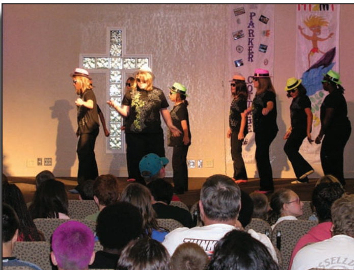
Performing at the talent show