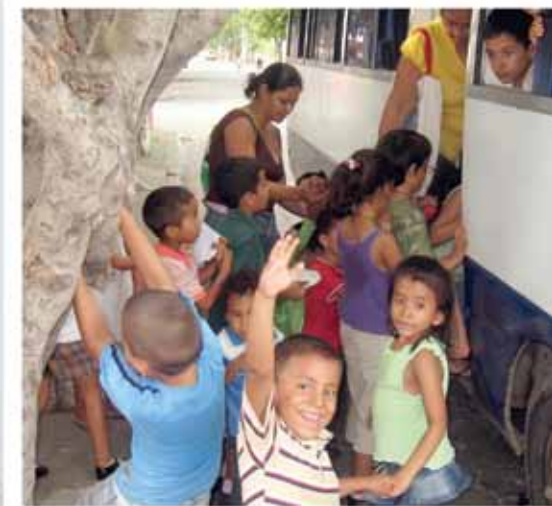
Below, the kids board the bus in various areas around Managua and are transported to Bethel Baptist Church where they receive a hot meal and participate in games, music, and learn Bible stories.