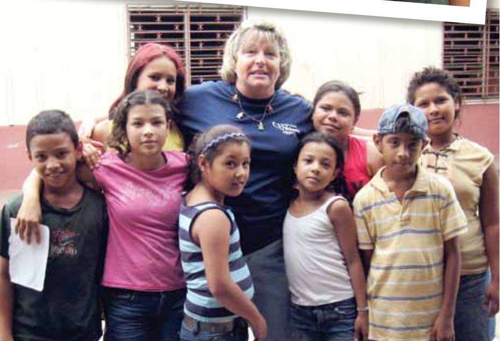
Top: The boys often act tough, but they enjoy having fun & fellowship at the Vacation Bible School program.

It is estimated that in the capital city of Managua that there could be upwards of 15,000 school-aged children on the streets. Many of these children live in and around the sprawling public markets where it is easier to scavenge for food. Some work shining shoes or cleaning windshields, but many simply beg or steal in order to get food and other necessities.