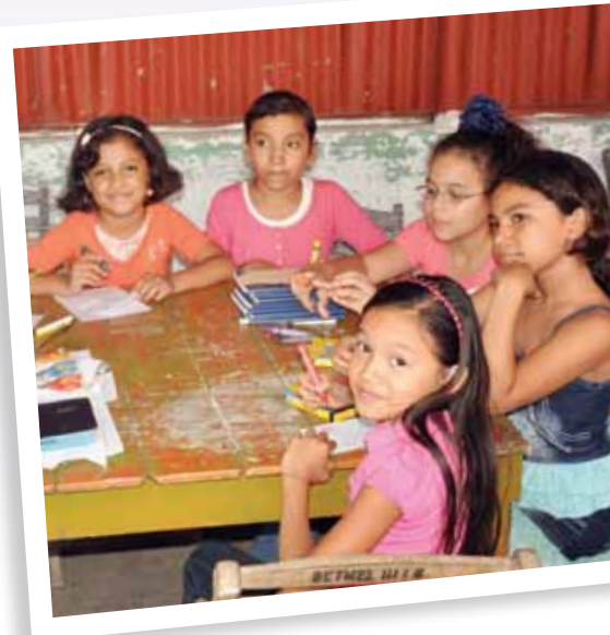
Above, the children enjoy crafts and games during the Vacation Bible School style program.

Go to our website OrphansHeart.org to learn more about our week long mission trips or contact us at 305-271-4121.